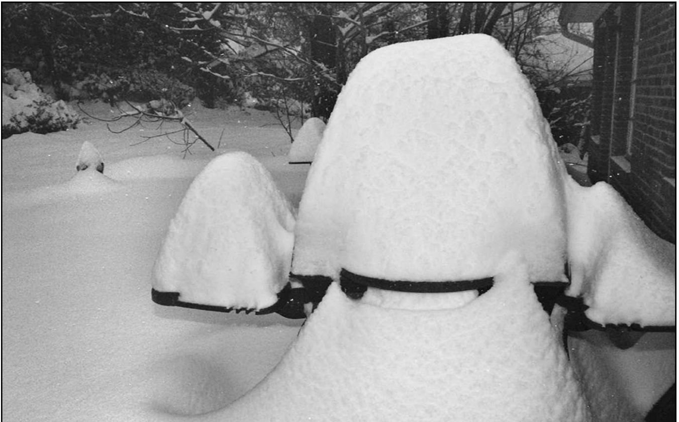
December 2009, Old Spring Rd.

RCHA Rock Creek Hills Citizens' Association 9909 East Bexhill Drive Kensington, MD 20895